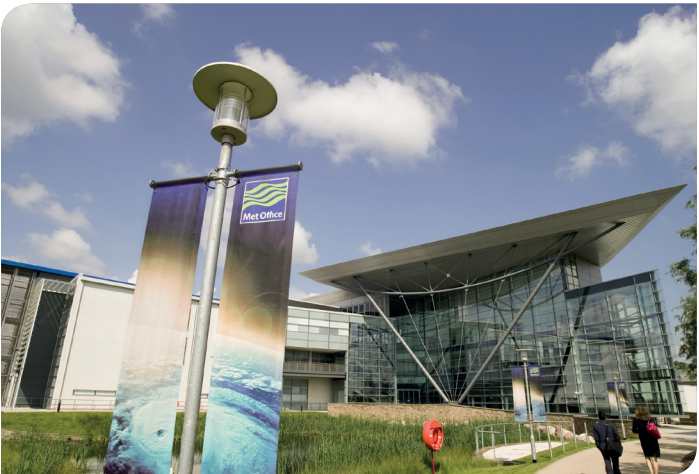
The Met Office headquarters in Exeter, the first building to achieve certification under all three parts of BREEAM In-Use

To have an asset formally certified, you need to engage the services of an independent BRE Global licensed BREEAM In-Use auditor. The Auditor role is to verify the answers given in the BREEAM In-Use online questionnaire, validate the evidence obtained and to request final formal certification.