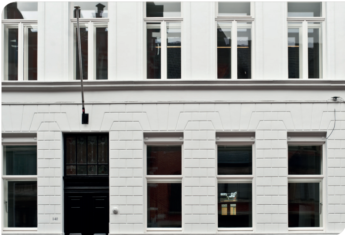
Oude Houtlei 140 in Ghent, headquarters building for Bopro, a sustainably refurbished listed building assessed to BREEAM In-Use, BREEAM In-Use award winner 2011

Occupier Management – this assesses the understanding and implementation of management policies, procedures and practices; staff engagement; and delivery of key outputs (Please note: Part 3 is activity specific)